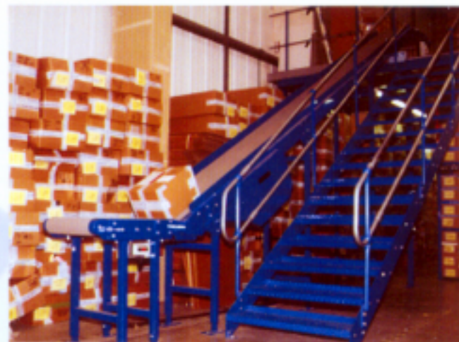
BELT CONVEYOR to mezzanine floor to aid storage.